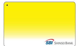
016 Passion Yellow