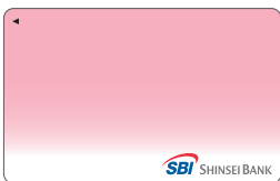
009 Cherry Blossom