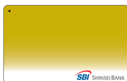
026 Straw Hat