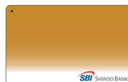
027 Café au lait