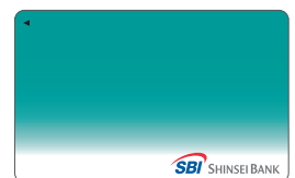
024 Morning Aqua