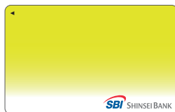
018 Fresh Leaves