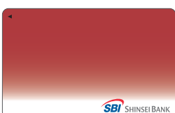
029 Chocolate Caramel