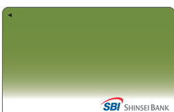
025 Green Tea