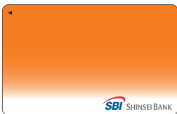
013 Orange Juice