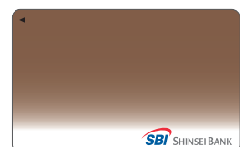
028 Mocha Brown