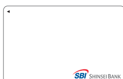
030 White Christmas