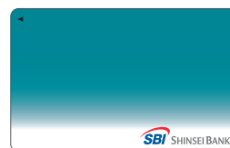
023 Indigo Blue