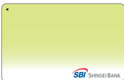
017 Melon Soda