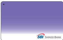
005 Dreamy Purple