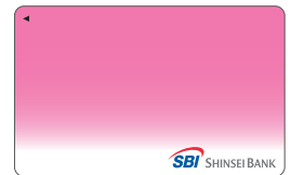
008 Baby Face