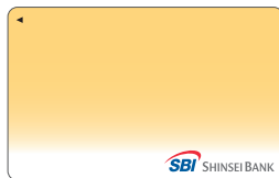
014 Crème Brûlée